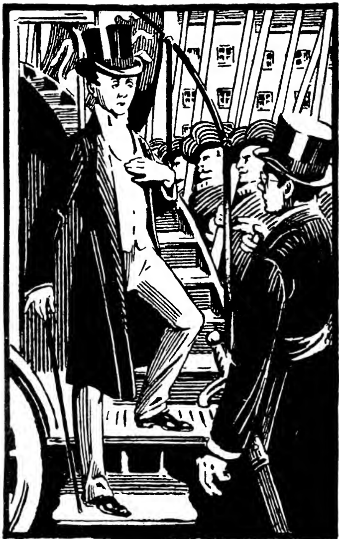
KING AUBERON DESCENDED FROM THE OMNIBUS WITH DIGNITY